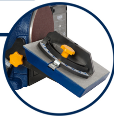
Table tilts from 0° to 45° Comes with miter gauge